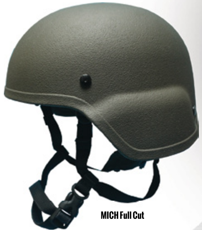
MICH Full Cut