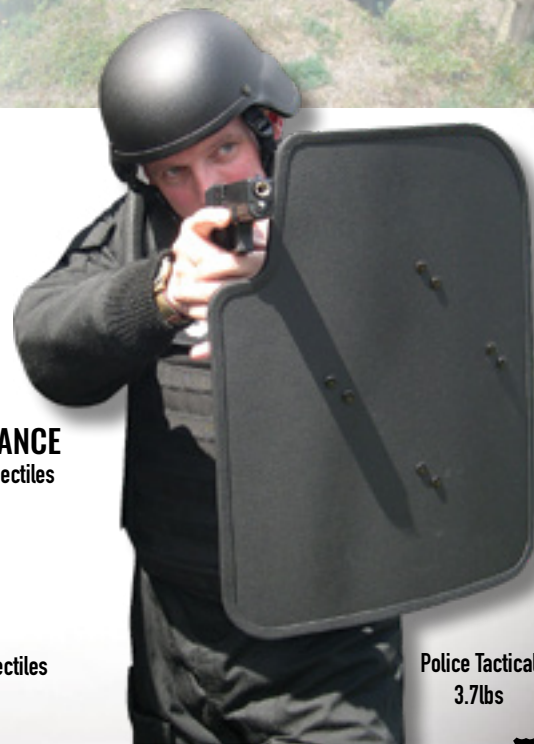
Police Tactical 3.7lbs