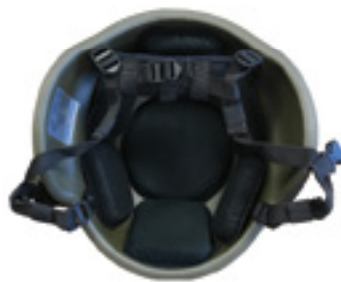
7 Pad System