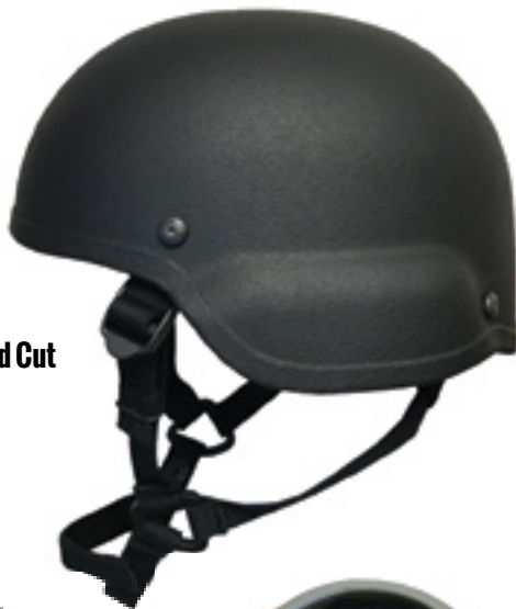
MICH Mid Cut