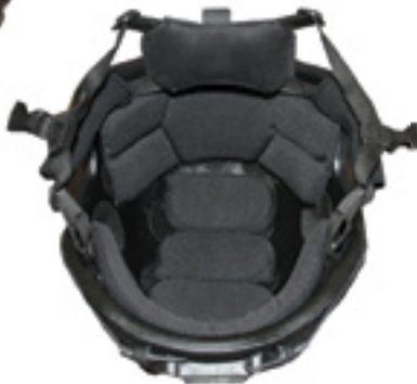
4D Combat Pads System