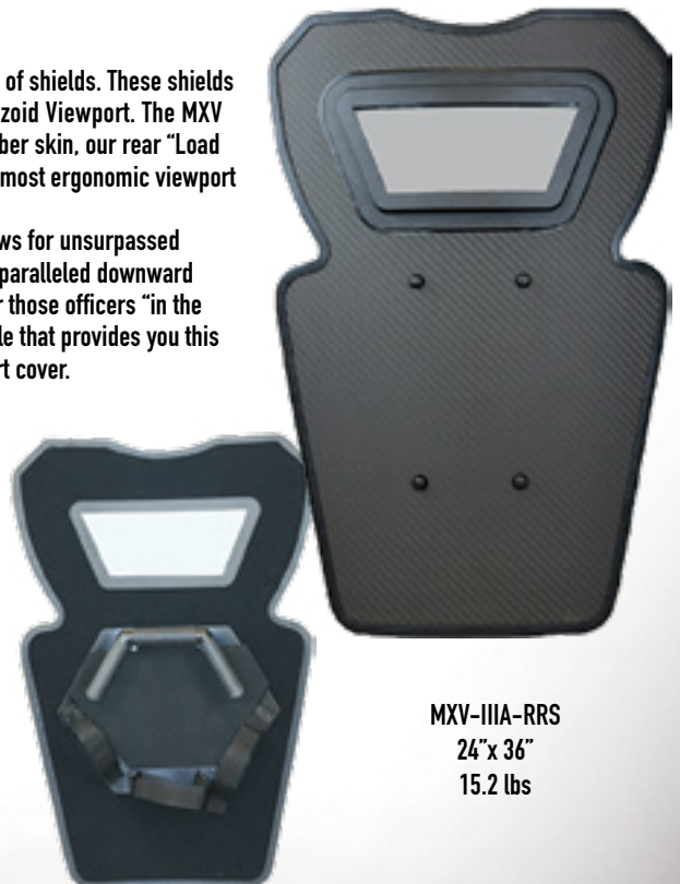
MXV-III A-RRS 24" x 36" 15.2 lbs