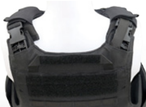
Rear Quick Release