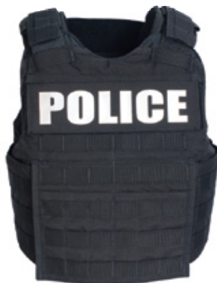
Base Vest Front