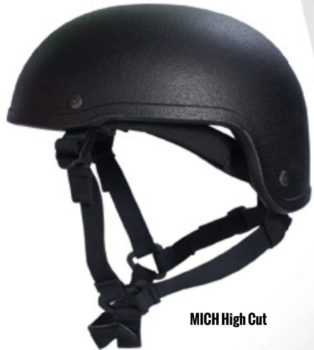
MICH High Cut