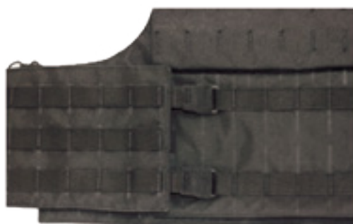
The "G-Hook" cummerbund attachment system

All ballistic (listed below) and non-ballistic accessories are attached to our vests using our unique "G-Hook" MOLLE attachment system. allowing for quick adjustment on the fly, flat low profile design and a sturdy attachment of the accessories to the vest.