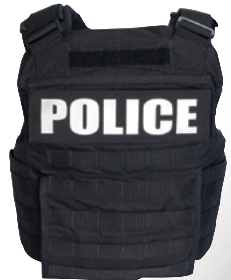
Base Vest Back